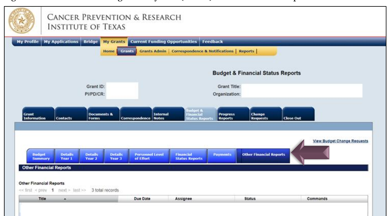
Figure 6: CPRIT Grant Management System (CGMS) "Other Financial Reports" subtab

The other financial reports must be submitted through CGMS/CARS under the "Other Financial Reports" sub-tab under "Budget & Financial Status Reports."