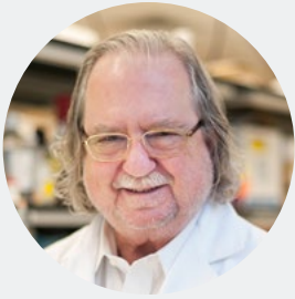
Dr. Jim Allison, MD Anderson Cancer Center

Between 1982 and 1996, Dr. Jim Allison and his colleagues hunted for, and succeeded in discovering, a protein in the human body, CTLA-4. They proved it behaves like a brake on the immune system, contrary to the view most researchers held at the time. The discovery led to the development of the drug Yervoy.